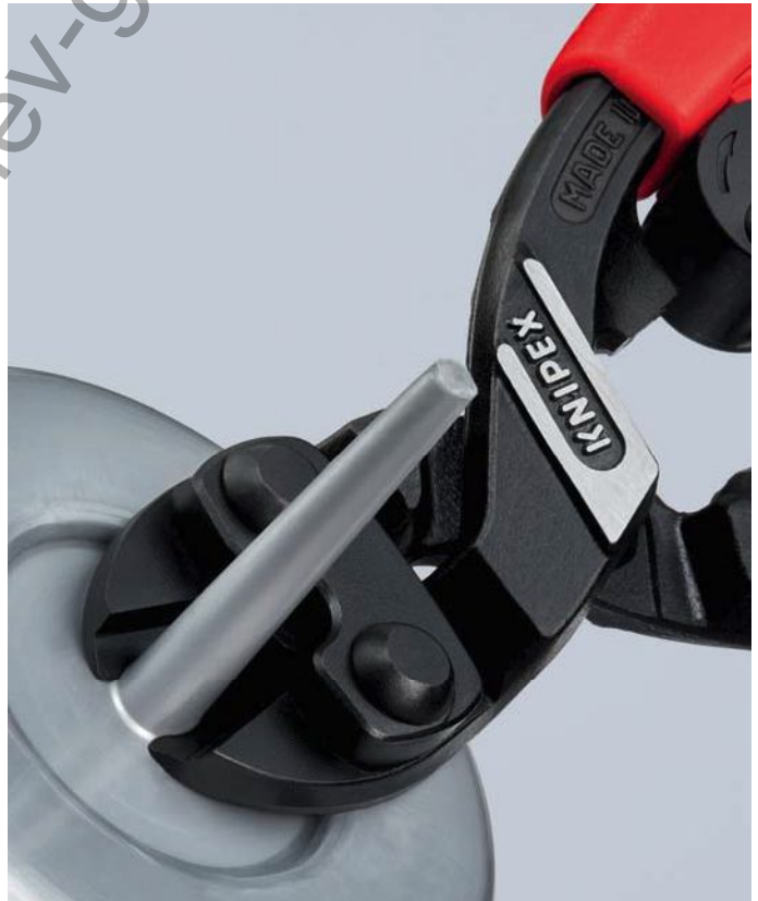
Ideal for the flush cutting of plastic sprues with large diameters