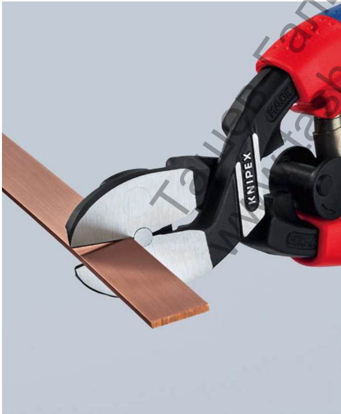
Copper busbars are cut cleanly and flush